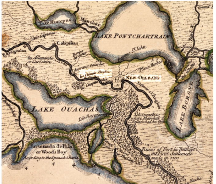
A detail of Plan of New Orleans the capital of Louisiana . . . in the year 1720, 1759. By Thomas Jeffreys. Norman B. Leventhal Map & Education Center Collection. Cannes Bruslées and New Orleans are highlighted.