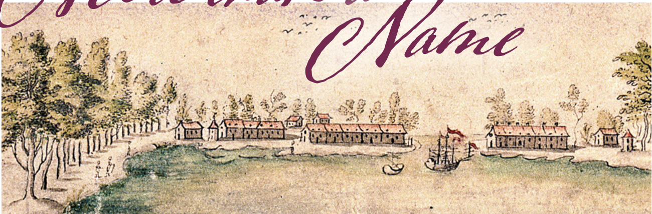
A detail of Map of Louisiana, View of New Orleans, 1720 . Drawn by de Beauvilliers. Library of Congress.