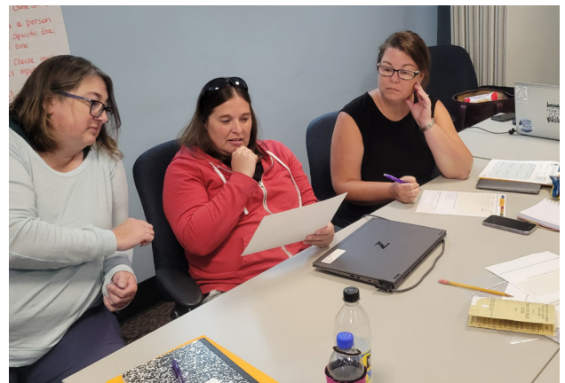
Maine Teacher Workshop.