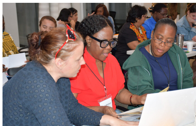
USVI Teacher Workshop, Photo courtesy of the Caribbean Genealogy Library.