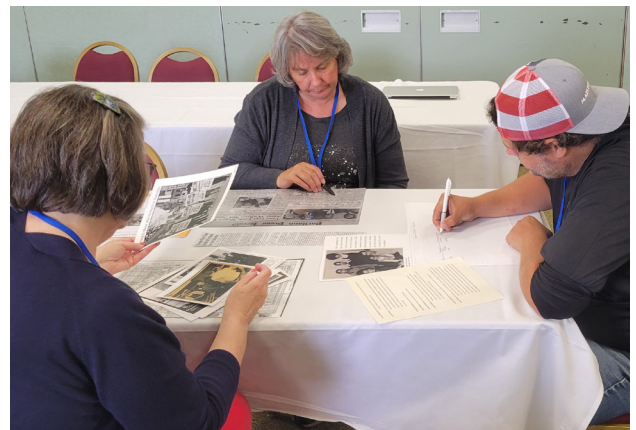
Maine Teacher Workshop.